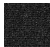
● 黑灰 Charcoal